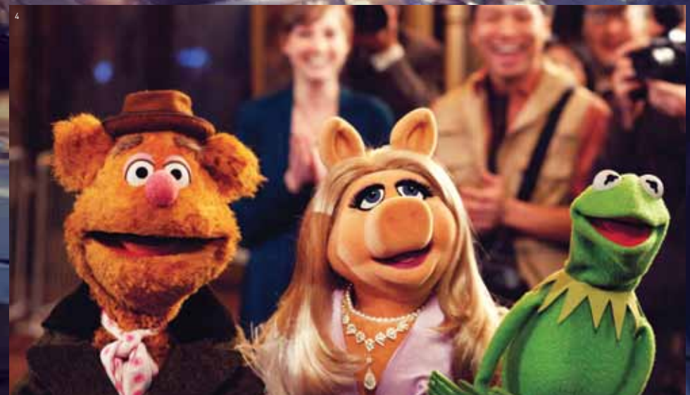
1 Casablanca / 2 A Matter of Life and Death 3 A Bridge Too Far / 4 The Muppets