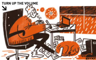
TURN UP THE VOLUME