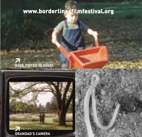
ROSE TINTED GLASSES